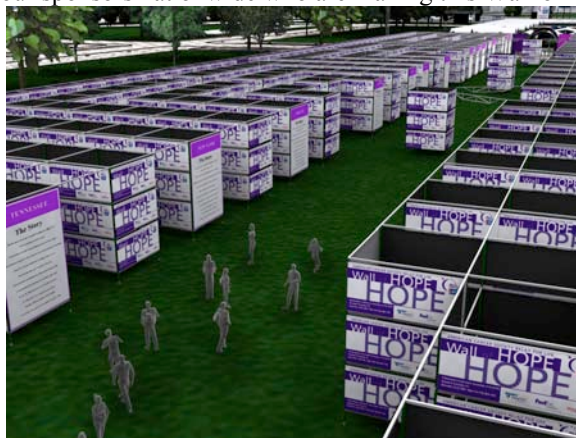
(Artist rendering – actual design may vary)

Local banner sales are definitely picking up and Relay season is just around the corner – look for your local banner at a Relay event in your community soon! As of March 3, we have secured close to 21 percent of our potential sponsorship, with Great Lakes already at 70 percent of their banners sold. Kudos to all of you in the Great Lakes Division that are working so hard to make this happen. And a great big THANK YOU to ALL of our sponsors nationwide who are making this Wall of Hope possible!